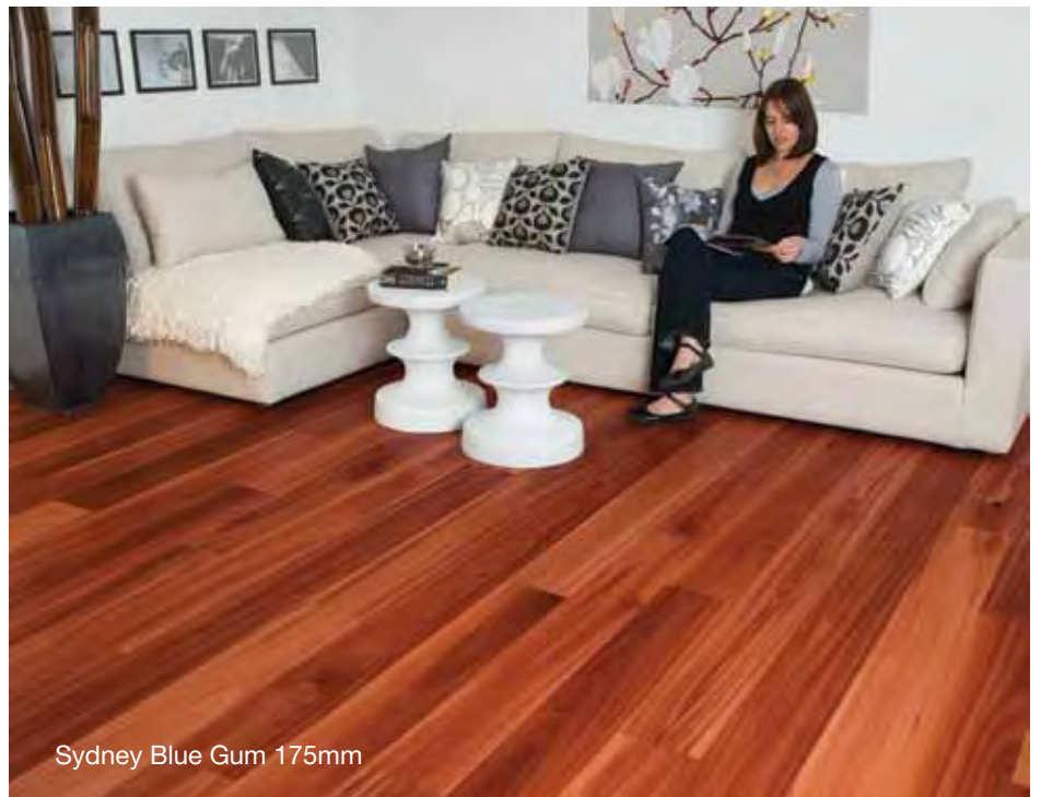
Sydney Blue Gum 175mm

For full Boral Silkwood installation, care and maintenance or warranty information, please contact Boral Timber on 1800 818 317 or visit www.boral.com.au/timber